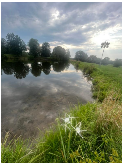
Spider-lilly a stunning native plant is blooming this week at the Arboretum. Spot it at the Mahr Historic Home, wetland area, and Mahr lake.